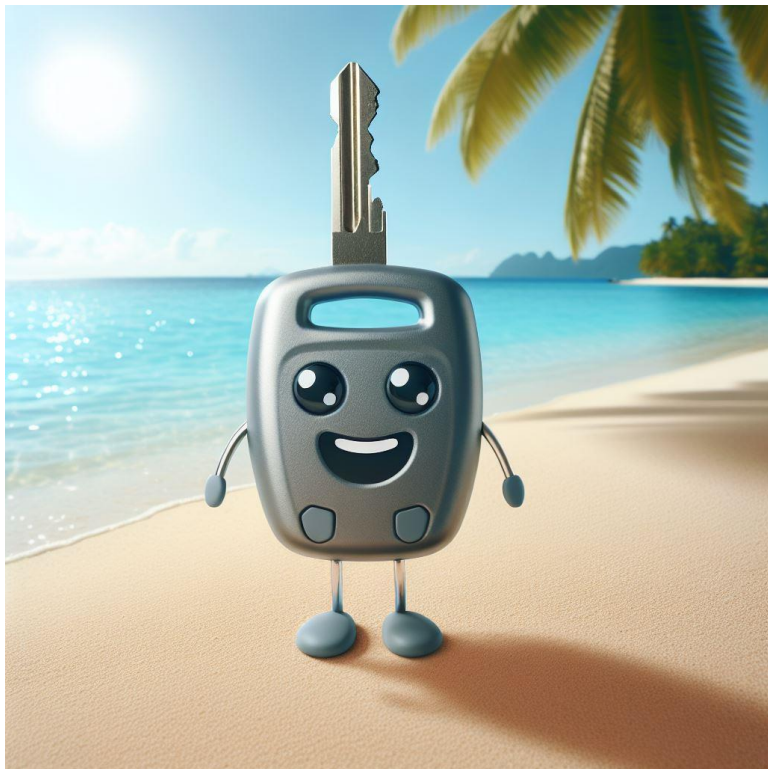
AI created image

Whether you are spending a day at the beach, running in to the supermarket or to pay for fuel – LOCK YOUR CAR!!