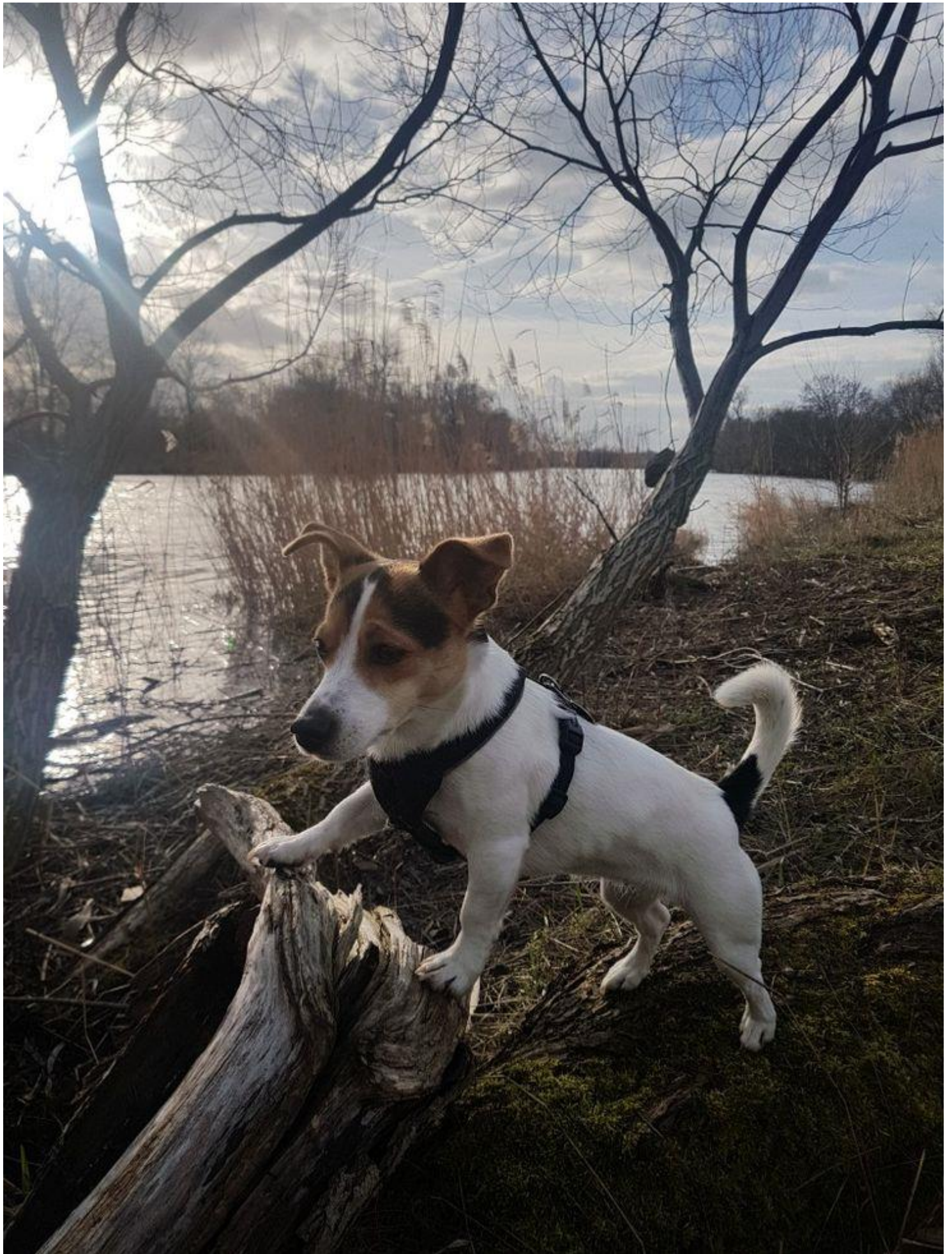
Harley on the lookout for water rats